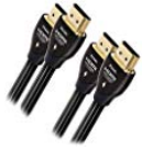
AudioQuest Pearl 1.5m (4.92 ft.) Black/Wh...